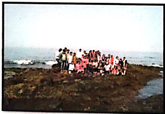
Glimpses of Excursion at Malvan, Sindhudurg